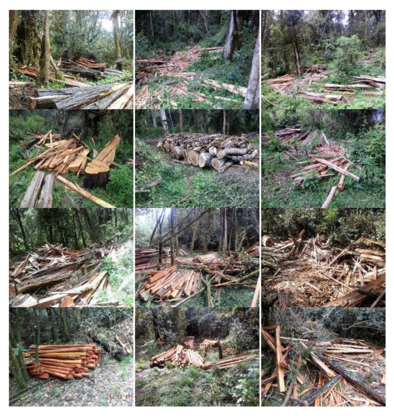
Figure 1: Illegal logging in Maasai Mau forest (September/October 2016)

In September/October 2016, an extensive elephant census / forest health survey was undertaken across the Mau Forests Complex. The survey recorded widespread forest destruction, in particular illegal logging of Cedar trees. The photographs below were taken during the survey.