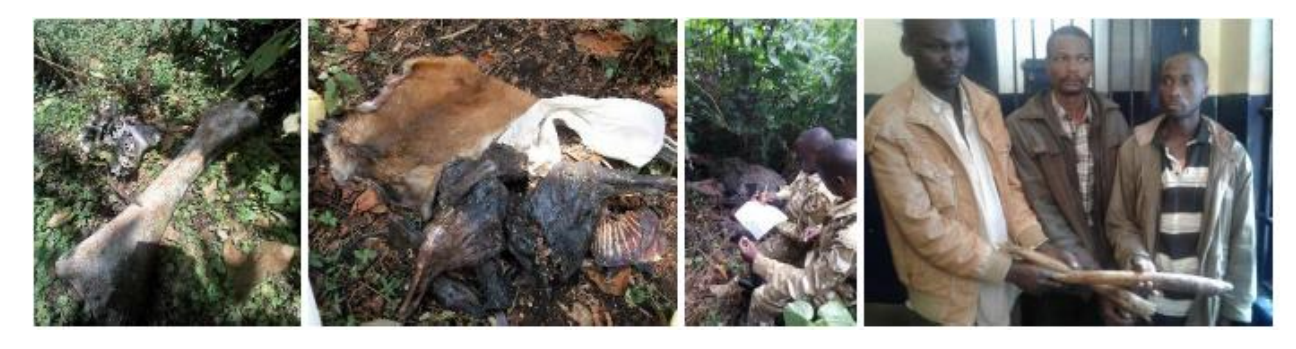
Figure 6: Poaching in Transmara Forest Reserve (September/October 2016)