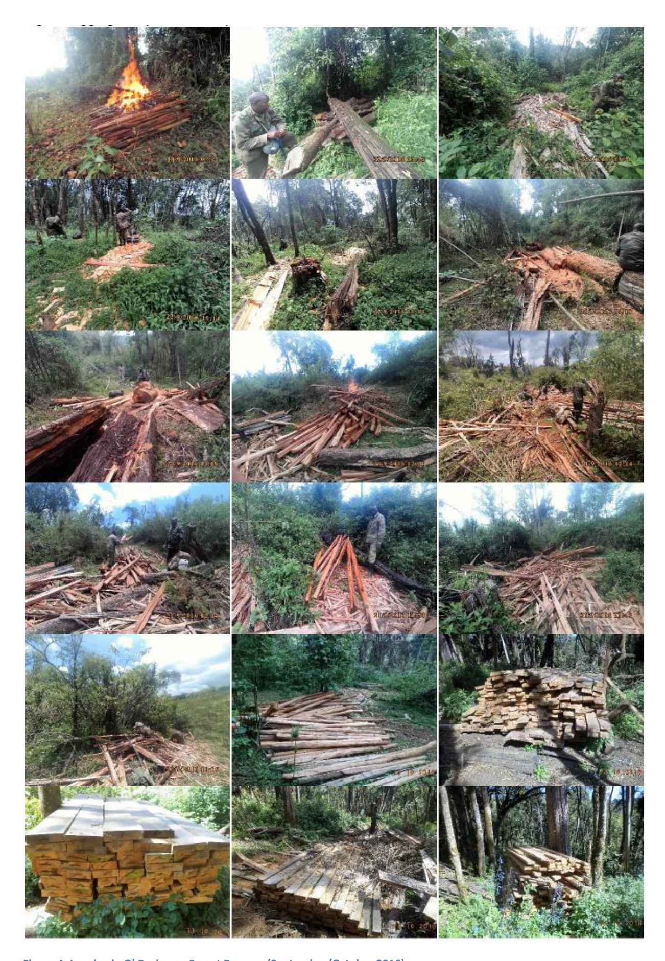
Figure 4: Logging in OI Pusimoru Forest Reserve (September/October 2016)