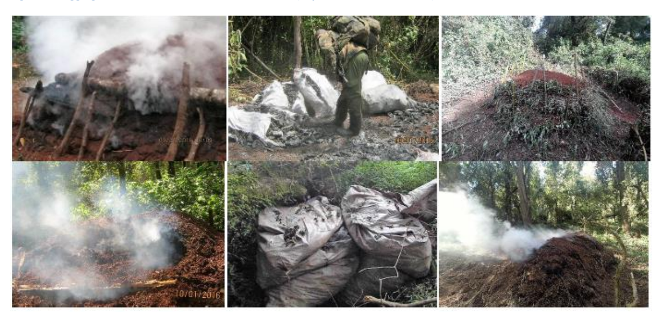
Figure 8: Charcoal making in South Western Mau Forest Reserve (September/October 2016)