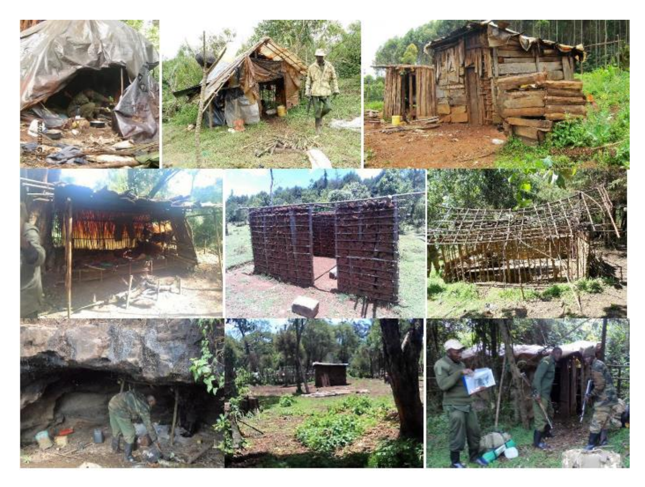
Figure 9: Illegal structures in South Western Mau Forest Reserve (September/October 2016)