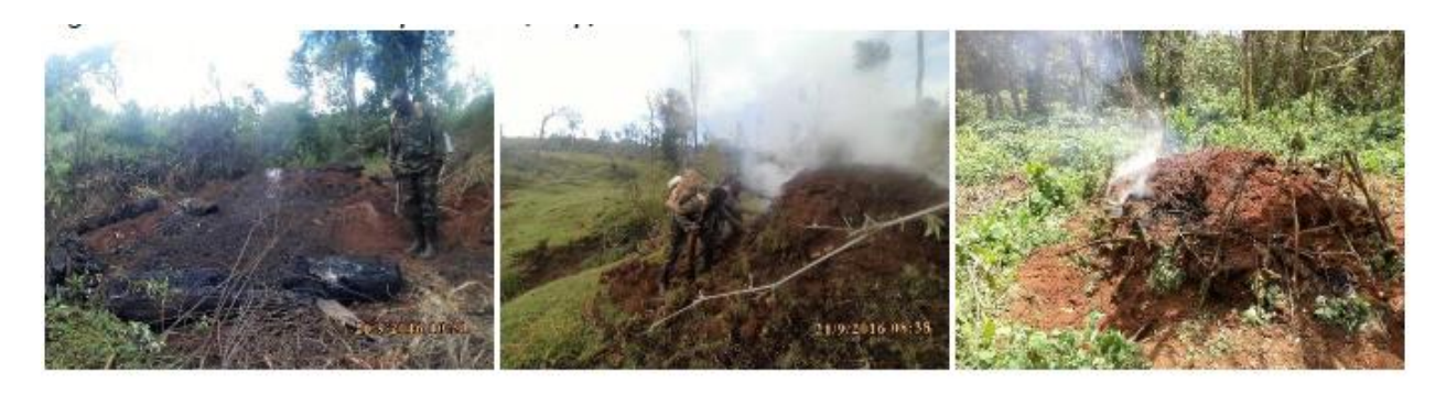
Figure 5: Charcoal making in Ol Pusimoru Forest Reserve (September/October 2016)