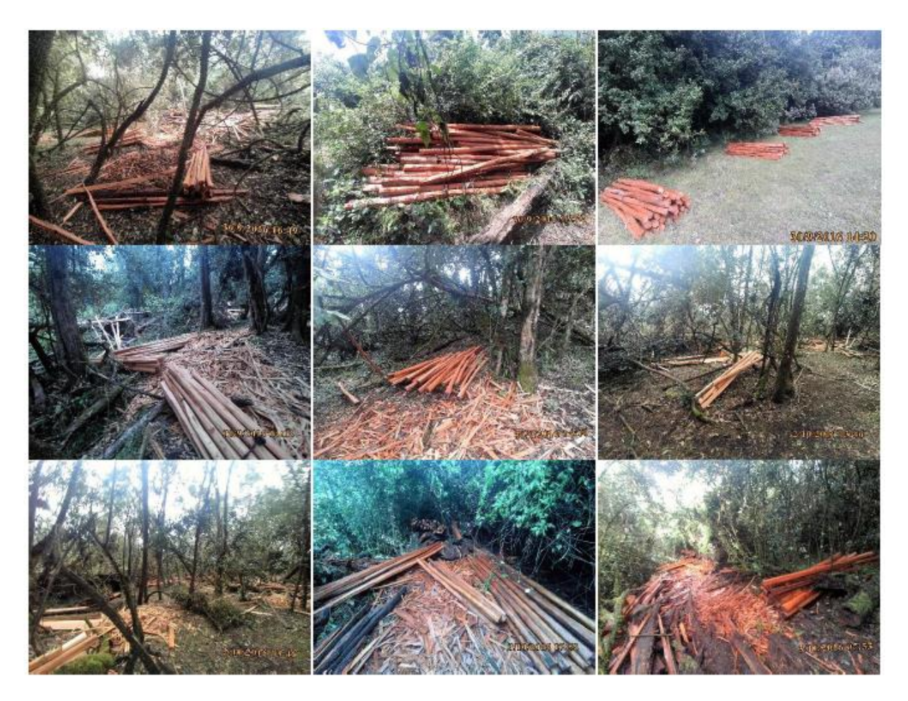
Figure 2: Illegal logging in Maasai Mau forest (September/October 2016)