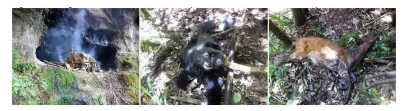
Figure 3: Bushmeat in Maasai Mau forest (September/October 2016)