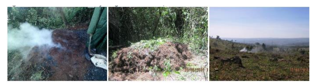
Figure 10: Charcoal making and clear-felling in Mt. Londiani Forest Reserve (September/October 2016)