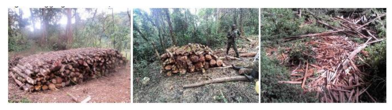
Figure 7: Logging in South Western Mau Forest Reserve (September/October 2016)