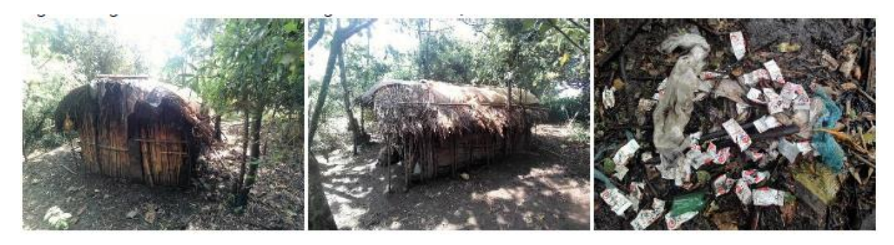
Figure 11: Illegal shelters and littering in Mt. Londiani Forest Reserve (September/October 2016)