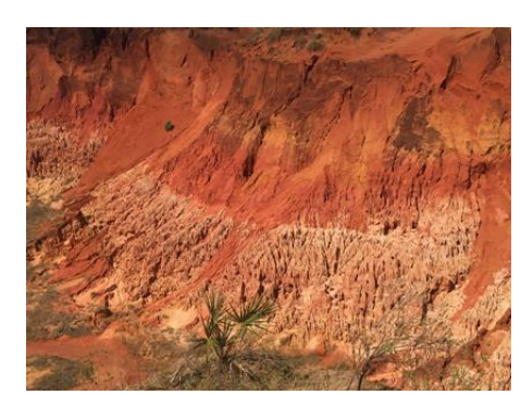
Left picture: Forests Landscape, Watershed Irodo, Region DIANA