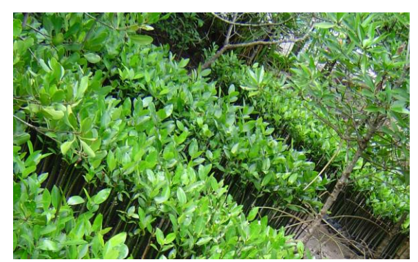
Tree Nursery

The target groups include, in particular, forestry and environmental policy makers in international initiatives and poor, rural population groups in selected countries. Women and young people will receive special support.